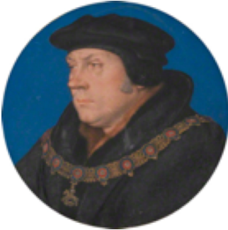
Thomas Cromwell as Chief Minister of Henry VIII.